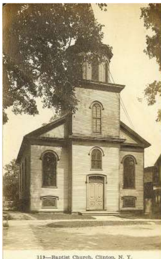
119—Baptist Church, Clinton, N. Y.