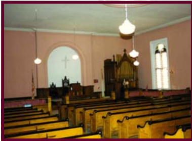
Baptist Church Sanctuary

Here are just a few pictures depicting progress of the renovation at various points. Many more are available at the museum. Stop in to see them all.