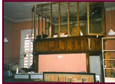
Renovation work on loft