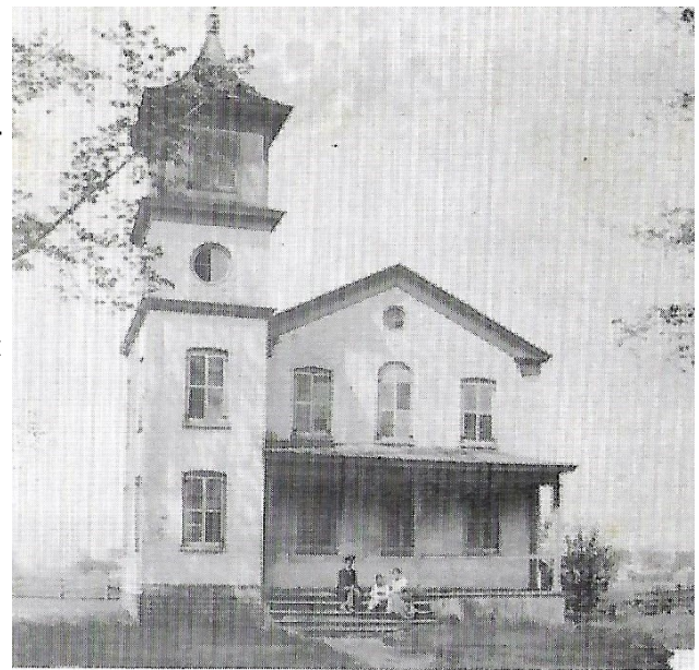
CLINTON GRAMMAR SCHOOL, COLLEGE STREET

The Grammar School was one of the longer lasting and more successful schools, which prepared boys for college.